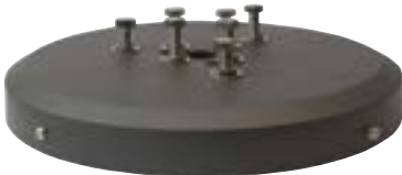
(Cover with Bollard Anchorage)